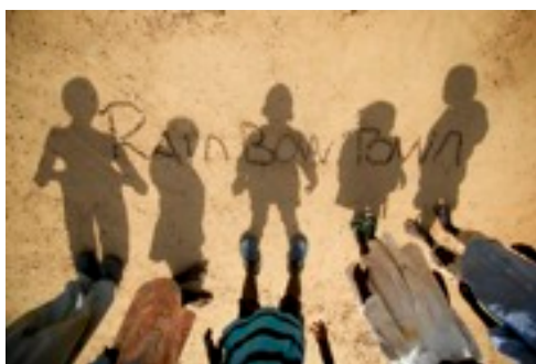
Rainbow Town film

For more information on either the Selmon family or the Center for Social Justice, contact the center at center.for.social.justice@ou.edu .